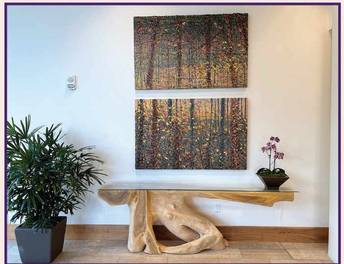
"Fantasy Forest I & II" David Schaefer – 2011 Oil on Canvas Greets Visitors at the South Tower Reception Desk

Visit www.gallerynightmke.com for a complete schedule of participating galleries.