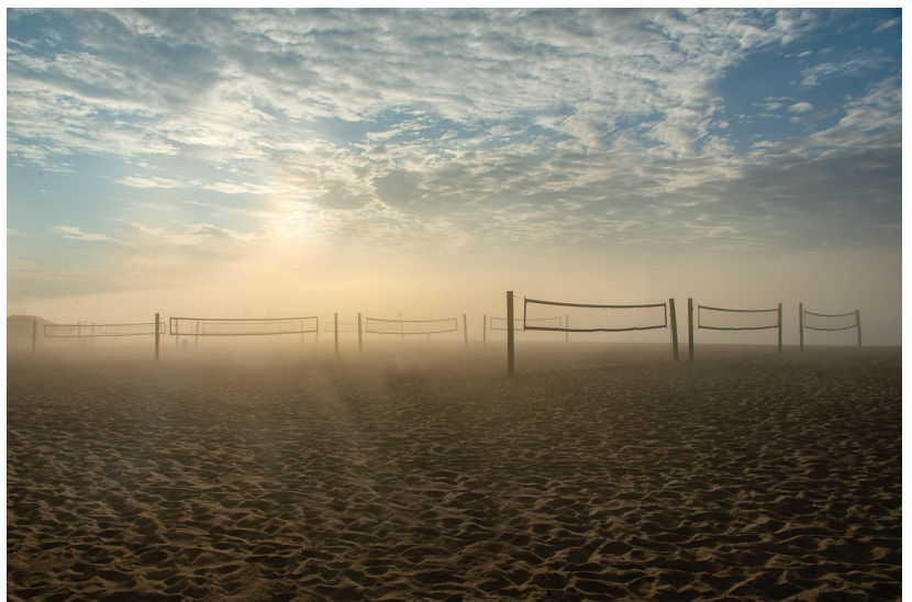
Bradford Beach June 8, 2021, 6:10 a.m. Phyllis Bankier

Metaphorically and literally they were dark days. A global pandemic brought untold misery to millions, and lockdowns and social distancing became ways of life. Physical contact was fraught with danger. Showing remarkable commitment and perseverance, every day from September 2020 to September 2021, four Milwaukee